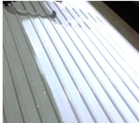
APPLICATION OF FIRST COAT OF THERMACOOL 0.3M FR