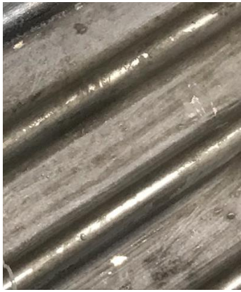
ADEQUATE SURFACE PREPARATION